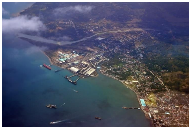
Figure 1. Toledo City land Area: Source wikipedia

The study was conducted in Toledo City. A 3rd class component city in the province of Cebu, Philippines. Toledo became a character city under Republic Act No. 2688 on June 18, 1960. Toledo is composed of 38 barangays and according to the 2020 census, it has a population of 207,314 people. Toledo is about 50 kilometers away from Cebu City and is widely known for its huge mining industry owned by Atlas Consolidated Mining and Development Corporation (now Carmen Copper Corporation). Aside from mining, the city's primary sources of livelihood are fishing, trading, and agriculture. The city of Toledo is the place where people used a lot of plastics, and this place was involved in this investigation because it actually caused sewer blockages, floods and other catastrophic damage from disposable plastics increase.