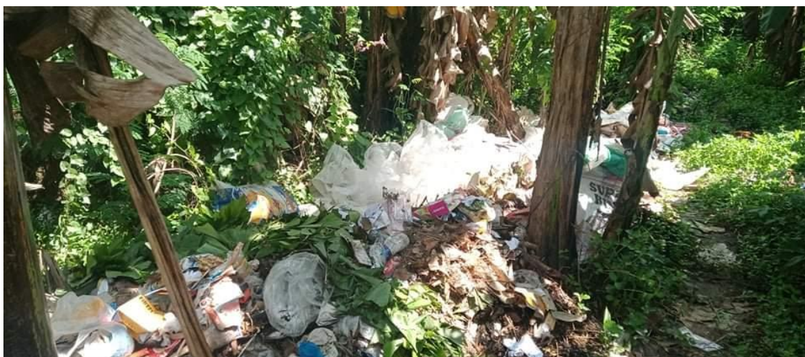
Figure 3. In Magdugo, Toledo City, Cebu, Philippines, inappropriate plastic management

Plastic accounts for almost 10% of the mass of human trash on land. Plastic pollution in the seas is comparable to 60-80% of litter. In any event, plastic bags generate enormous ecological problems in urban areas where wild life is rather constrained. Overflow water collects and transports useless plastic bags last, depositing them in storm drains. Once within these sewers, the pack forms regular bunches with various types of waste, eventually blocking the flow of water. Once in these sewers, the pack routinely forms bunches with various types of waste, eventually blocking the flow of water. Plastic is also responsible for the majority of contamination in the waterway and land, as it adversely affects both water and land species. Wind may also transport plastic debris or litter across the environment.