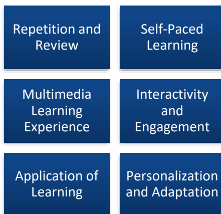
Figure 2: Key factors that contribute to enhanced knowledge retention

Here are some key factors that contribute to enhanced knowledge retention follow figure 2: